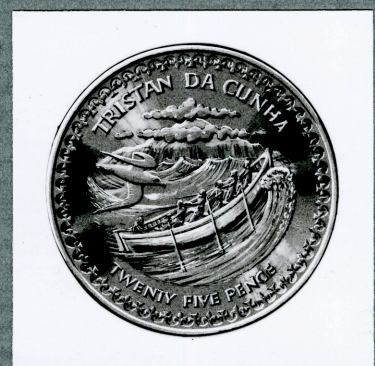
Tristan da Cunha